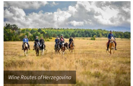
Wine Routes of Herzegovina