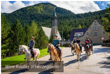
Wine Routes of Herzegovina