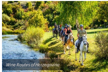
Wine Routes of Herzegovina