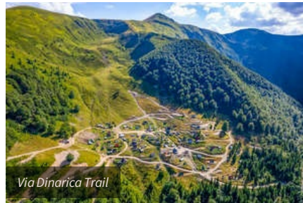
Via Dinarica Trail