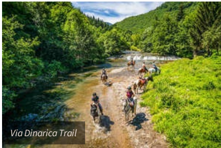
Via Dinarica Trail