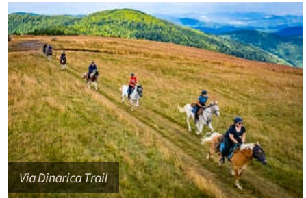
Via Dinarica Trail