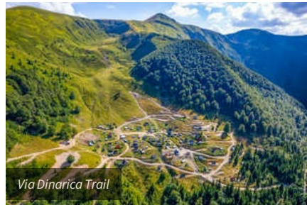
Via Dinarica Trail