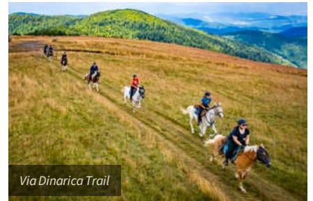
Via Dinarica Trail