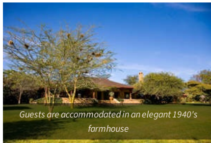
Guests are accommodated in an elegant 1940's farmhouse