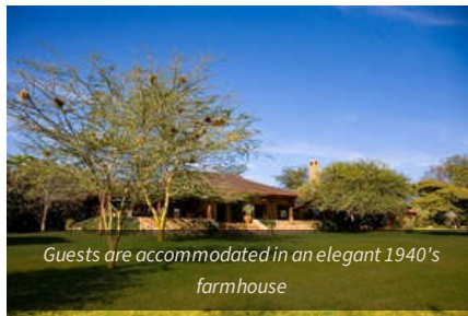
Guests are accommodated in an elegant 1940's farmhouse