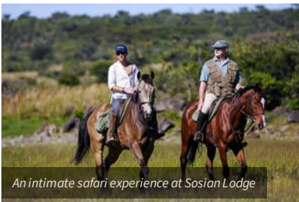
An intimate safari experience at Sosian Lodge