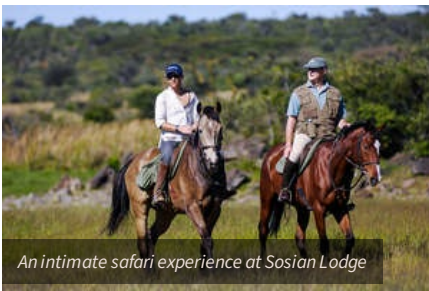
An intimate safari experience at Sosian Lodge