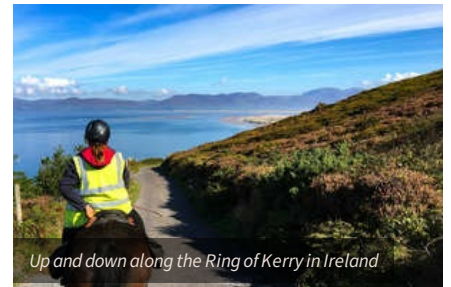
Up and down along the Ring of Kerry in Ireland