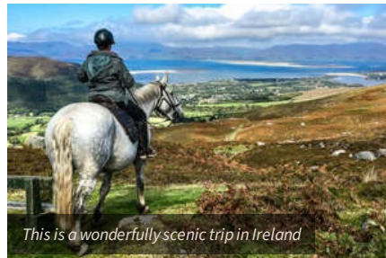
This is a wonderfully scenic trip in Ireland