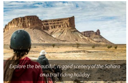
Explore the beautiful, rugged scenery of the Sahara on a trail riding holiday