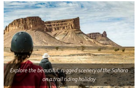
Explore the beautiful, rugged scenery of the Sahara on a trail riding holiday