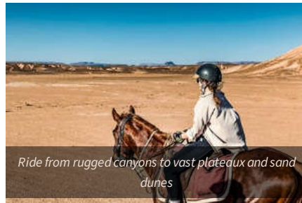
Ride from rugged canyons to vast plateaux and sand dunes