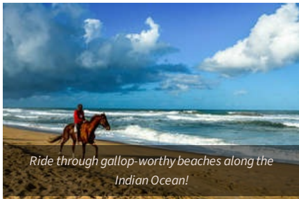
Ride through gallop-worthy beaches along the Indian Ocean!