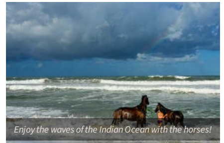
Enjoy the waves of the Indian Ocean with the horses!