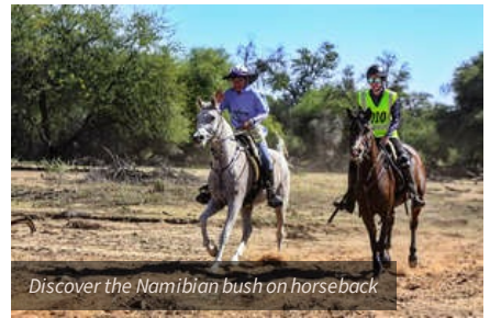
Discover the Namibian bush on horseback