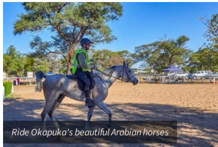
Ride Okapuka's beautiful Arabian horses