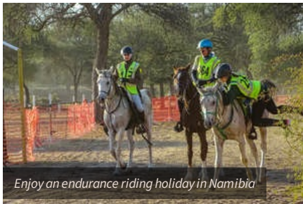
Enjoy an endurance riding holiday in Namibia