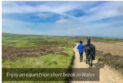
Enjoy an equestrian short break in Wales