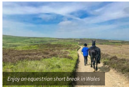
Enjoy an equestrian short break in Wales