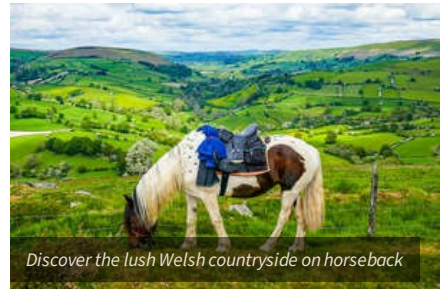
Discover the lush Welsh countryside on horseback