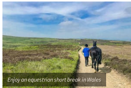
Enjoy an equestrian short break in Wales