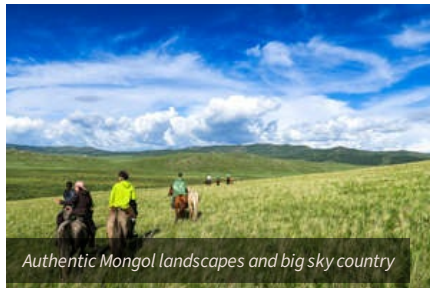
Authentic Mongol landscapes and big sky country