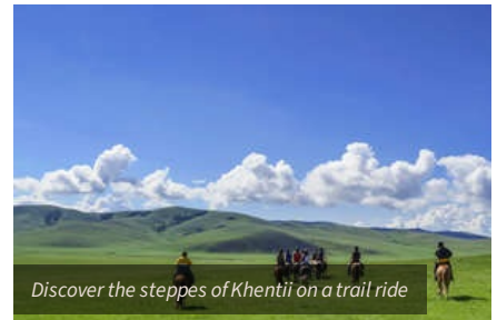
Discover the steppes of Khentii on a trail ride