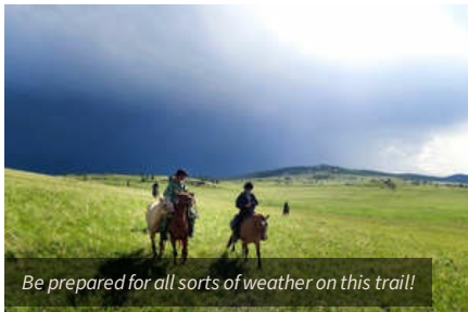
Be prepared for all sorts of weather on this trail!