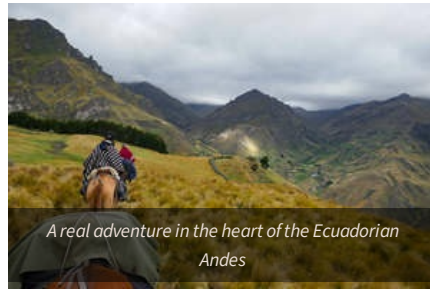
A real adventure in the heart of the Ecuadorian Andes