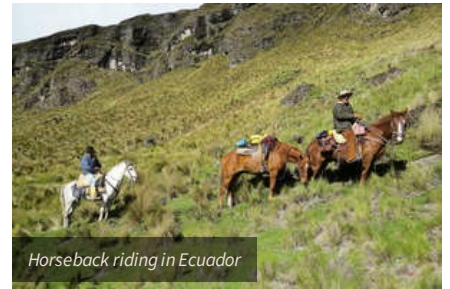
Horseback riding in Ecuador