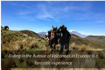
Riding in the Avenue of Volcanoes in Ecuador is a fantastic experience