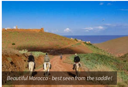
Beautiful Morocco - best seen from the saddle!