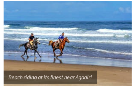
Beach riding at its finest near Agadir!