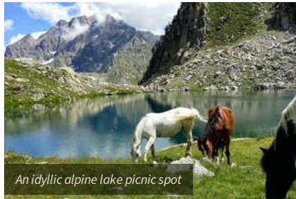
An idyllic alpine lake picnic spot