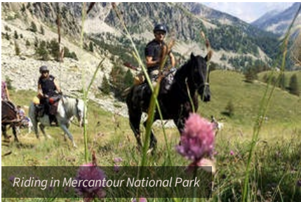
Riding in Mercantour National Park