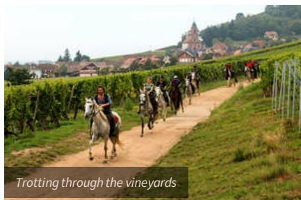
Trotting through the vineyards