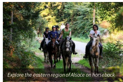
Explore the eastern region of Alsace on horseback