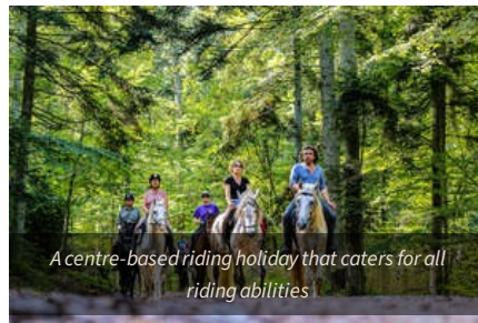
A centre-based riding holiday that caters for all riding abilities