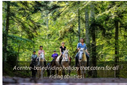
A centre-based riding holiday that caters for all riding abilities