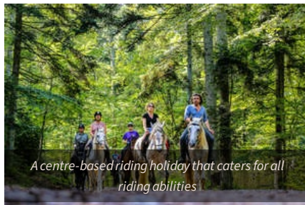
A centre-based riding holiday that caters for all riding abilities