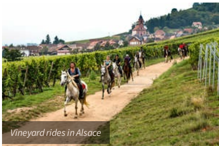
Vineyard rides in Alsace