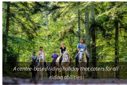
A centre-based riding holiday that caters for all riding abilities