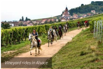
Vineyard rides in Alsace