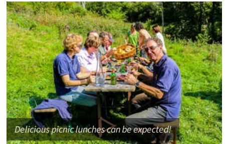
Delicious picnic lunches can be expected!