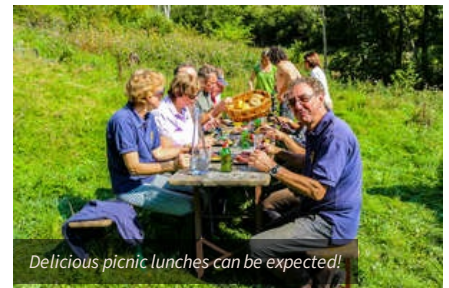
Delicious picnic lunches can be expected!