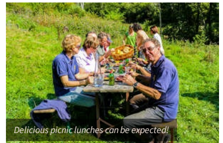
Delicious picnic lunches can be expected!