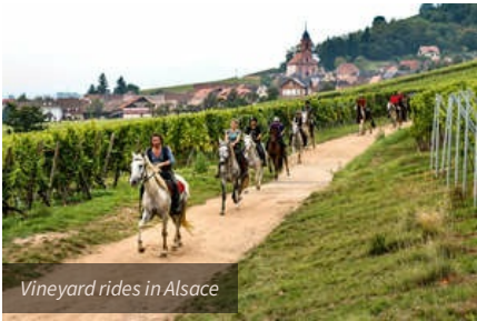
Vineyard rides in Alsace