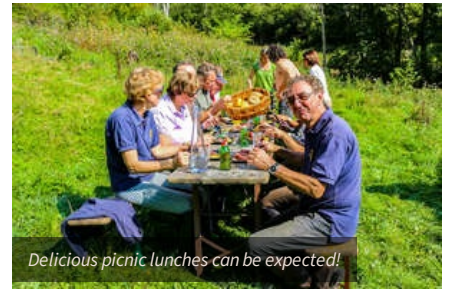
Delicious picnic lunches can be expected!