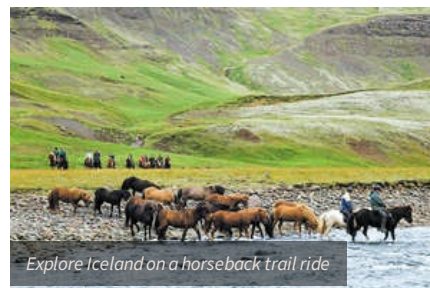
Explore Iceland on a horseback trail ride