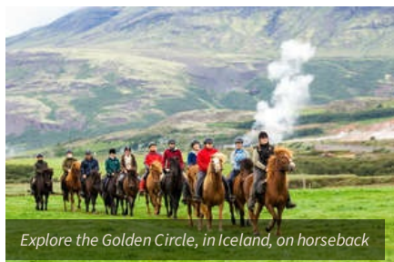
Explore the Golden Circle, in Iceland, on horseback