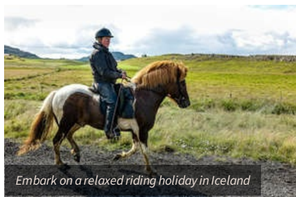
Embark on a relaxed riding holiday in Iceland