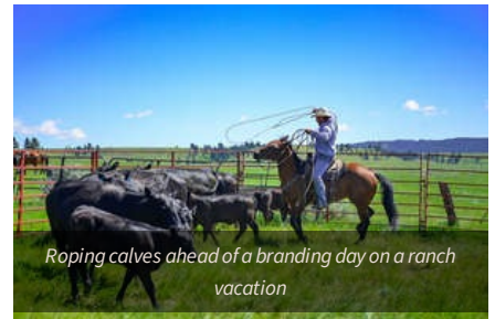
Roping calves ahead of a branding day on a ranch vacation