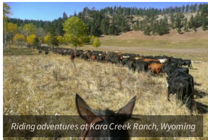
Riding adventures at Kara Creek Ranch, Wyoming