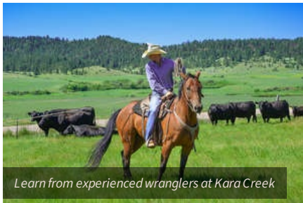
Learn from experienced wranglers at Kara Creek