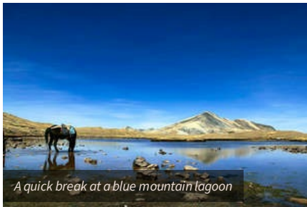
A quick break at a blue mountain lagoon