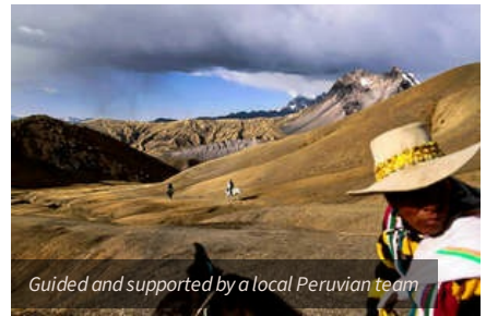
Guided and supported by a local Peruvian team