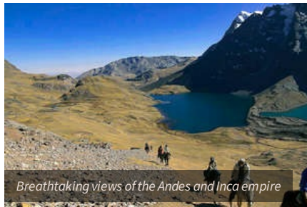
Breathtaking views of the Andes and Inca empire