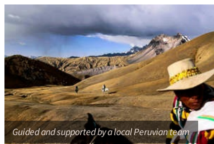
Guided and supported by a local Peruvian team