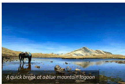
A quick break at a blue mountain lagoon