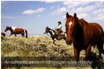
An authentic western riding experience in Idaho