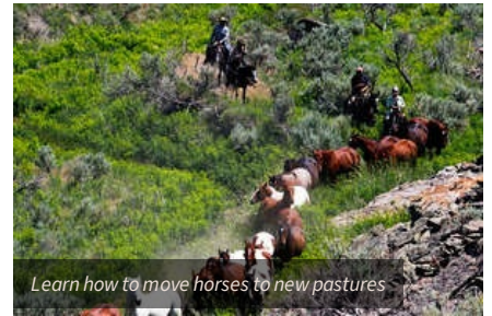
Learn how to move horses to new pastures