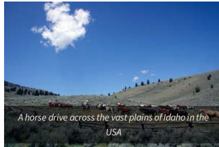
A horse drive across the vast plains of Idaho in the USA