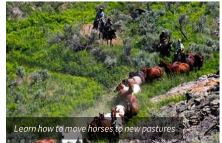
Learn how to move horses to new pastures