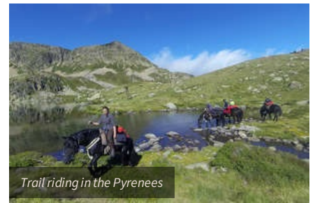
Trail riding in the Pyrenees