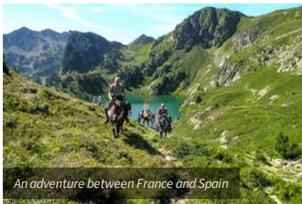
An adventure between France and Spain