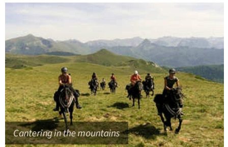
Cantering in the mountains