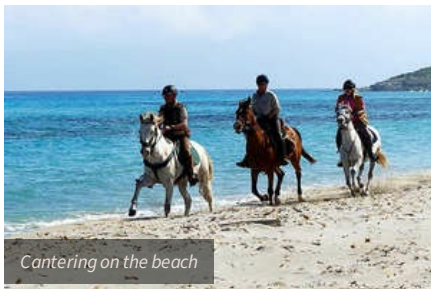
Cantering on the beach