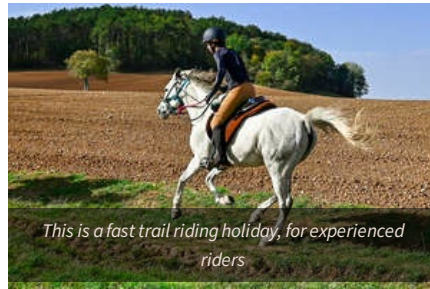
This is a fast trail riding holiday, for experienced riders