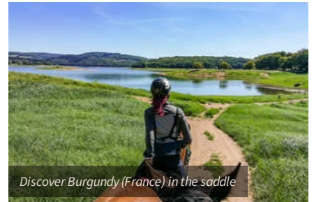
Discover Burgundy (France) in the saddle