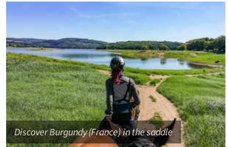
Discover Burgundy (France) in the saddle