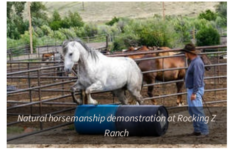
Natural horsemanship demonstration at Rocking Z Ranch