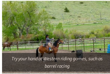
Try your hand at Western riding games, such as barrel racing