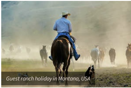
Guest ranch holiday in Montana, USA