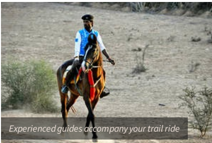
Experienced guides accompany your trail ride