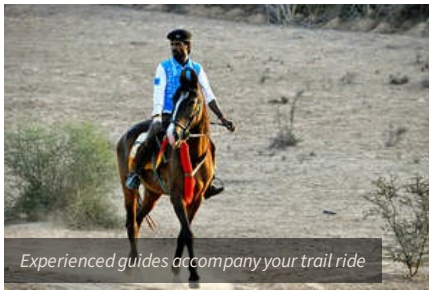
Experienced guides accompany your trail ride