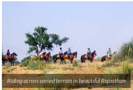
Riding across varied terrain in beautiful Rajasthan