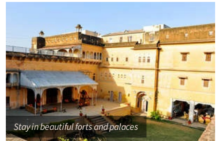
Stay in beautiful forts and palaces