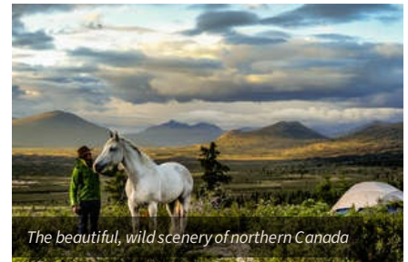
The beautiful, wild scenery of northern Canada