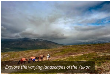
Explore the varying landscapes of the Yukon