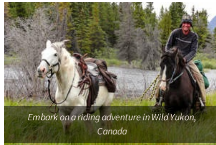
Embark on a riding adventure in Wild Yukon, Canada