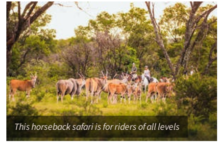
This horseback safari is for riders of all levels