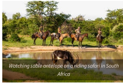
Watching sable antelope on a riding safari in South Africa