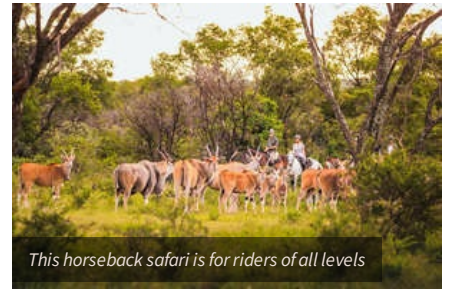
This horseback safari is for riders of all levels