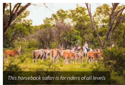
This horseback safari is for riders of all levels