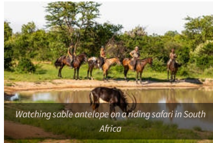
Watching sable antelope on a riding safari in South Africa