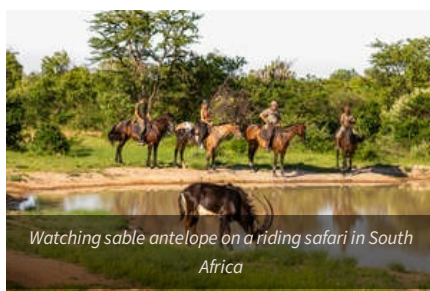
Watching sable antelope on a riding safari in South Africa