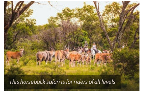
This horseback safari is for riders of all levels