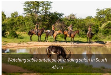
Watching sable antelope on a riding safari in South Africa