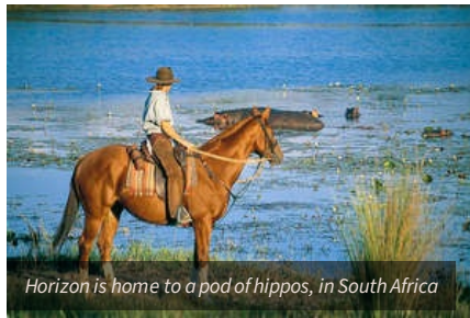
Horizon is home to a pod of hippos, in South Africa