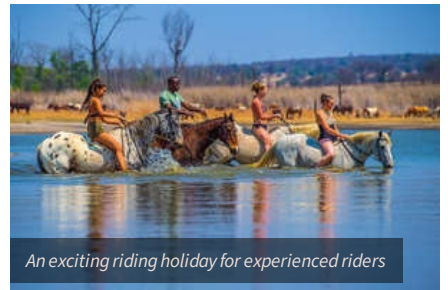
An exciting riding holiday for experienced riders