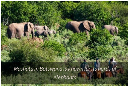
Mashatu in Botswana is known for its herds of elephants