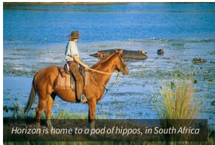
Horizon is home to a pod of hippos, in South Africa