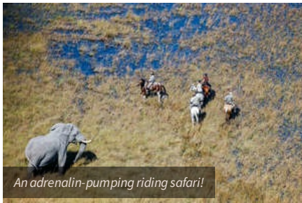
An adrenalin-pumping riding safari!