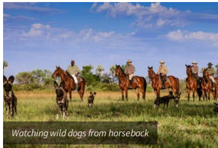
Watching wild dogs from horseback