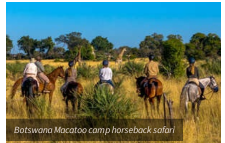
Botswana Macatoo camp horseback safari