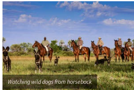
Watching wild dogs from horseback