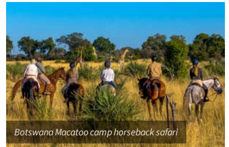
Botswana Macatoo camp horseback safari