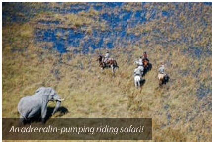
An adrenalin-pumping riding safari!