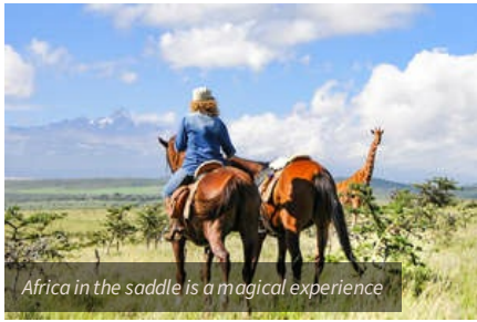
Africa in the saddle is a magical experience