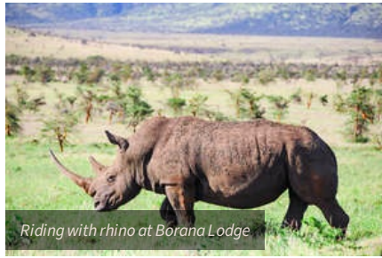
Riding with rhino at Borana Lodge